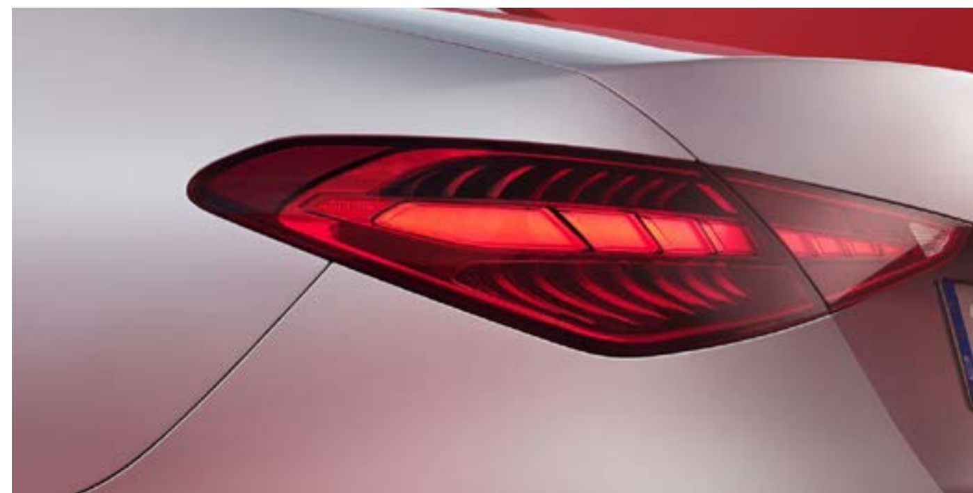
The striking rear with two-section tail lights.