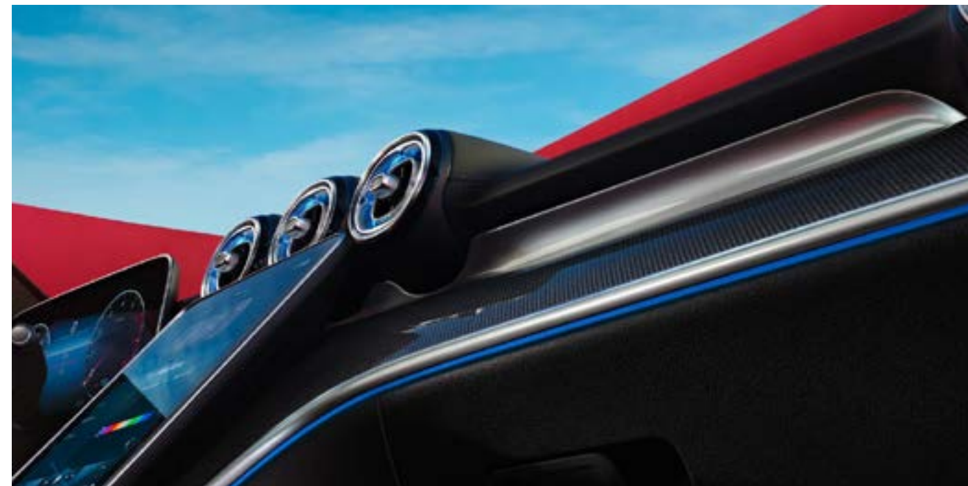
A space in which to feel good.