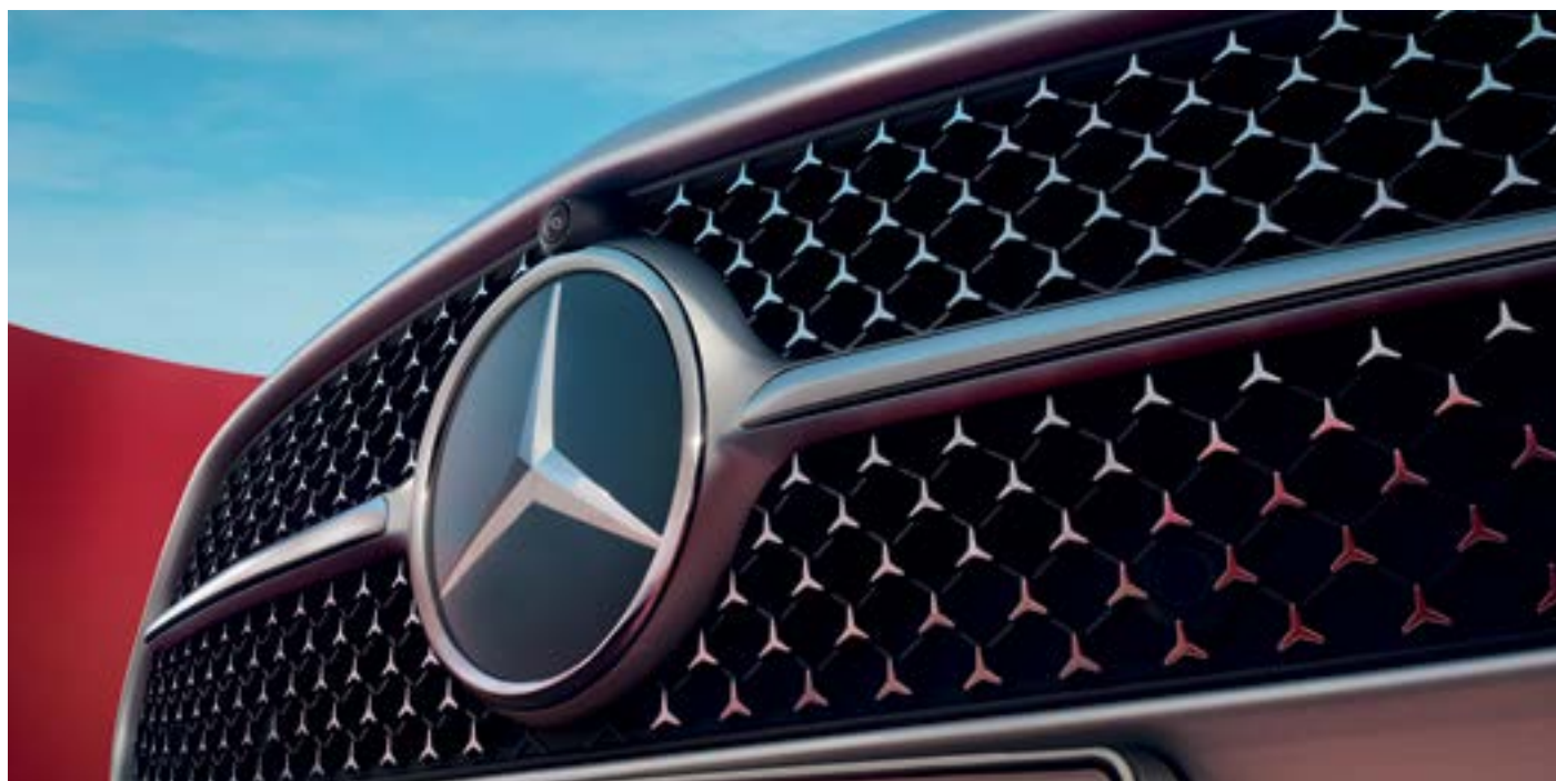
The new front design. Dynamic. Expressive.